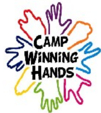
Camp Arroyo Livermore, California

For more information, please visit www.ttff.org