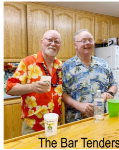
The Bar Tenders