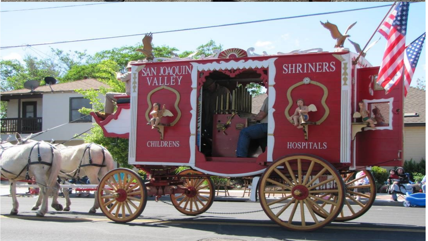
CLOVIS RODEO PARADE 2016