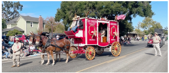
Paso Robles Pioneer Day Parade