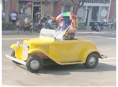
Corcoran Cotton Festival Parade