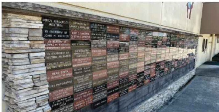
Wall of Fame, located on the outside of the Main Hall between the two sets of double doors.