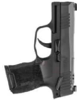
SIG SAUER P365 9MM NIT 10+1 OR SFTY CA