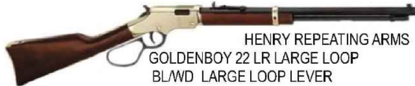
HENRY REPEATING ARMS GOLDENBOY 22 LR LARGE LOOP BLWD LARGE LOOP LEVER