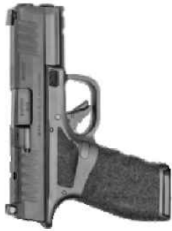
SPRINGFIELD ARMORY HELLCAT PRO OSP 9MM BK10+1 CA