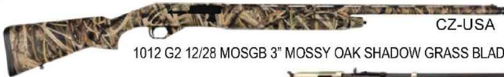
CZ-USA 1012 G2 12/28 MOSGB 3" MOSSY OAK SHADOW GRASS BLADES