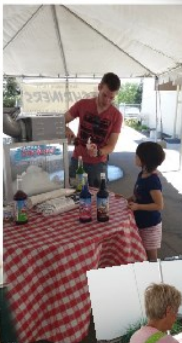
Masonic Family Day