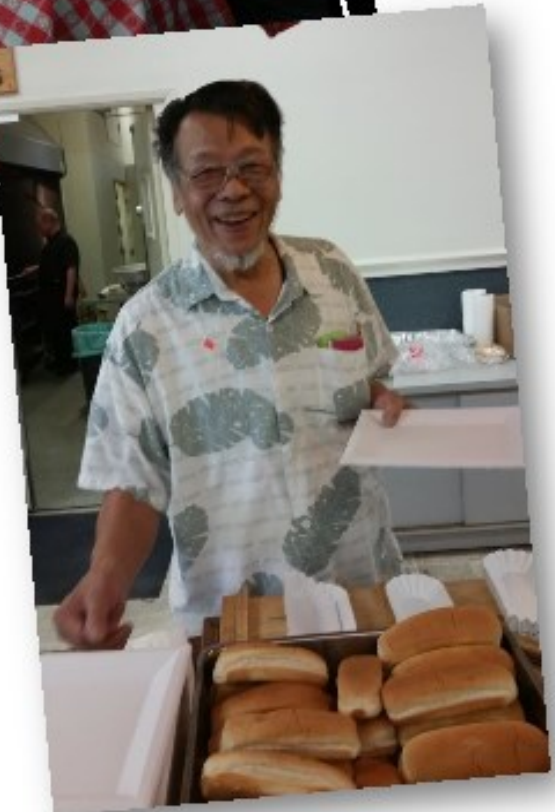
Masonic Family Picnic Continued