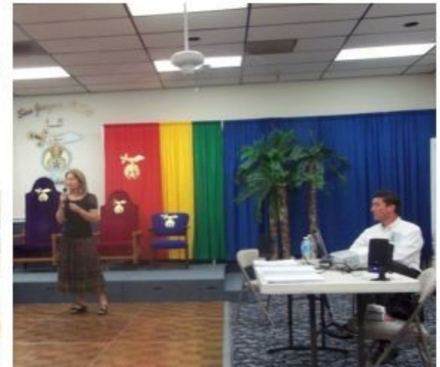
CAMBRIA PARADE AND STATED MEETING HOSPITAL PRESENTATION