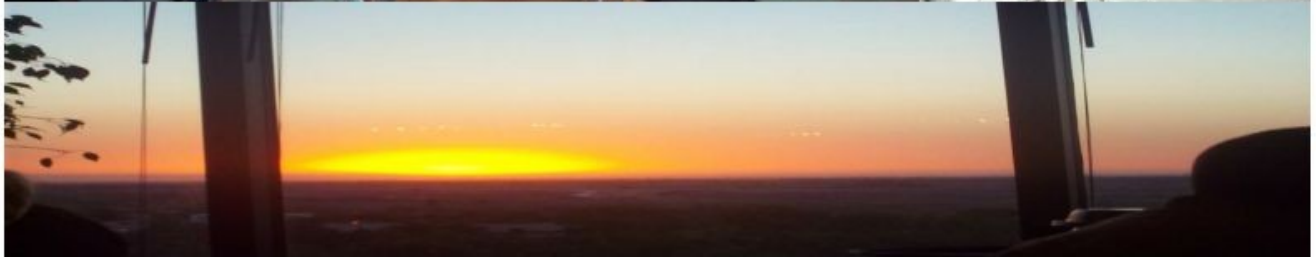
SOME OFFICIAL VISIT PICTURES - MORE NEXT SCROLL